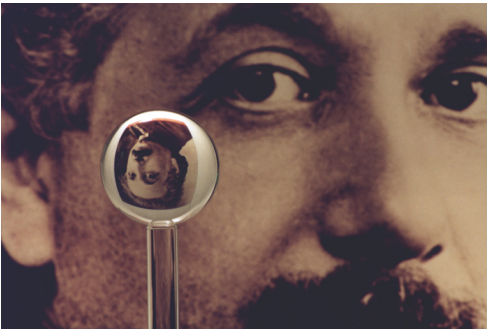
Figure 3: This nearly perfect sphere was used in the Gravity Probe B satellite experiment to test the curvature of spacetime near earth, as predicted the general theory of relativity. Here it is seen refracting an image of that theory's inventor.

These questions brought relativists in contact with other subdisciplines of physics, as such dense objects could be – and in fact had to be – described using nuclear physics methods. The relativists developed the theoretical concepts which, in the wake of astronomical discoveries in the early 1960s, impressively established the general relativity theory as an empirical physical theory with an unexpected scope of applications – a status that has been consolidated in the intervening 50 years.