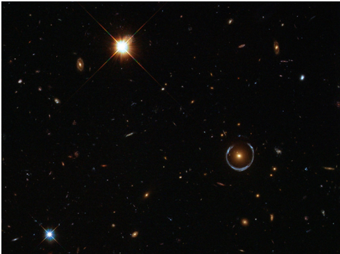
Figure 1: The image of a distant galaxy is distorted into a so-called Einstein Ring, due to the gravitational lensing effect, first predicted by Einstein himself on the basis of his general theory of relativity.

With the aim of studying these historical dynamics, Department I of the Max Planck Institute for the History of Science has established a Working Group in which historians of modern physics and international experts in general relativity and its history are combin-