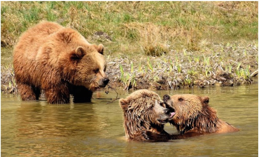
Fig. 1: The return of European brown bears to the Alps means that humans must learn about cohabitation.

The bears of Trentino are represented as foreign and dangerous, alien to the territory they inhabit. Citizens are called to assert control