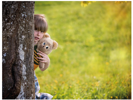
Fig. 4: Humans can live peacefully with real bears, too.

herding, for example, unfit for proximity to bears.