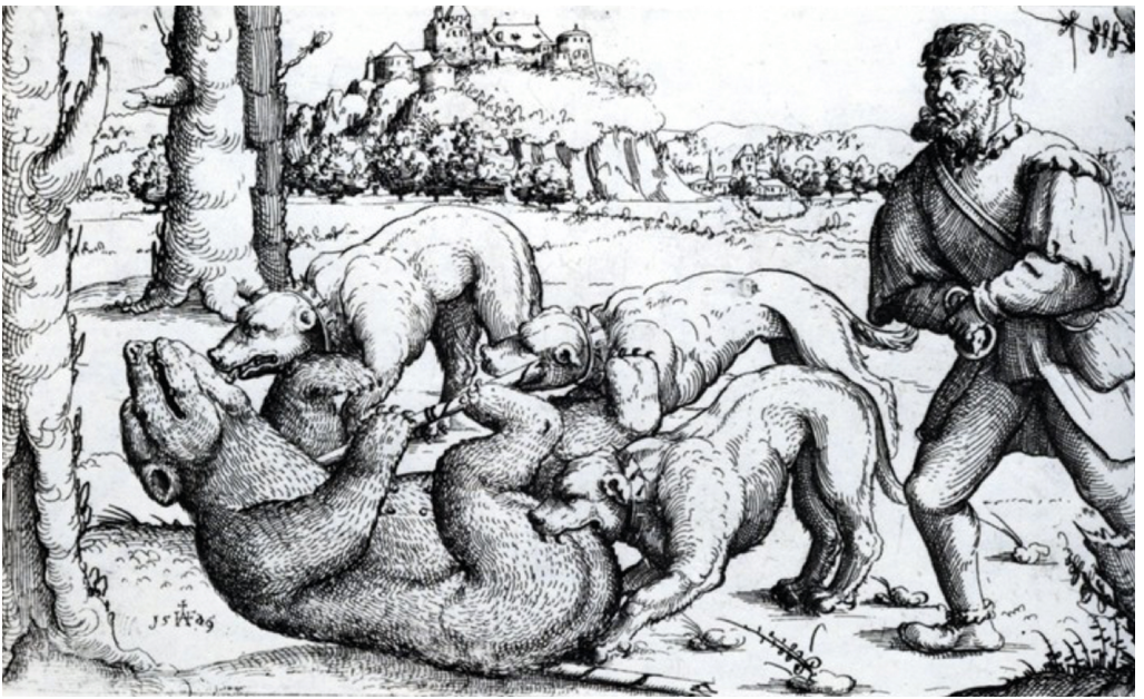
Fig. 2: Bear hunting throughout Europe led to the species' eradication in many areas.

over “their homeland,” reclaiming it from the bears that politicians of opposing factions have helped to reintroduce and after centuries of willful destruction.