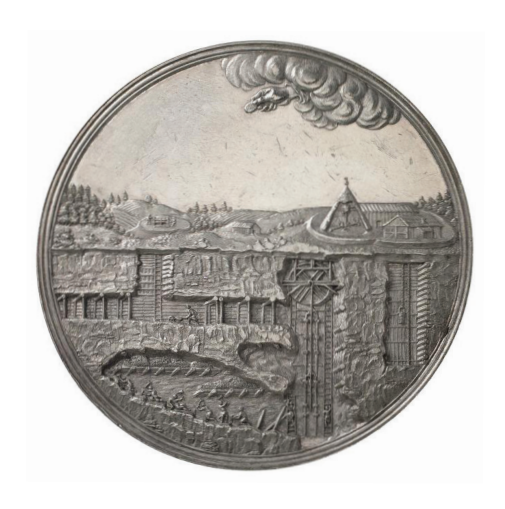
Fig. 1: This commemorative silver medal marked the completion of an aquaduct (shown on the obverse) as well as the first payment of a dividend after years of loss. Münzkabinett, Staatliche Museen zu Berlin, Inv. Nr. 18207762.

poorer, while more sophisticated technology was needed for their extraction. Heavy machinery was built to lift people and materials, and air was pumped into unnatural depths; water was gathered to push wheels and help drain the lower galleries. Costly process architectures emerged in order to move the ore from the rock, to crush it, and to melt the metal out of the dust. The need for coordinating the various works necessary in underground mines created environment in which bureaucratic routines-clusters of regulated practices that dovetailed the efforts of different people with different roles—could emerge and thrive. The wheels, pumps, and shafts were thus just the more externally visible components of systems of coordinated labor, in which actors sought to stabilize inputs and outputs and turn the "gamble" of the early days into a source of