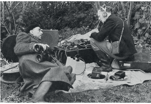
Fig. 3: Nature recordist and radio personality Ludwig Koch (left) lying in wait around an improvised recording studio. From Koch (1955), Memoirs of a Birdman . London: Phoenix House.

song excerpts against a noiseless background, however, scientists learned to disregard species whose songs included elongated and detailed duets or the influence of an acoustic environment on the formation of song for the next decades. The analysis carried out in this study reminds us that the historical contingencies of the cultural conditions under which scientific techniques develop shape the ways in which we come to hear the world.